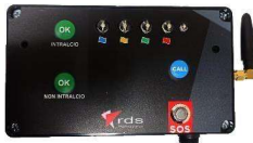
BOX GPS (owned by RDS)